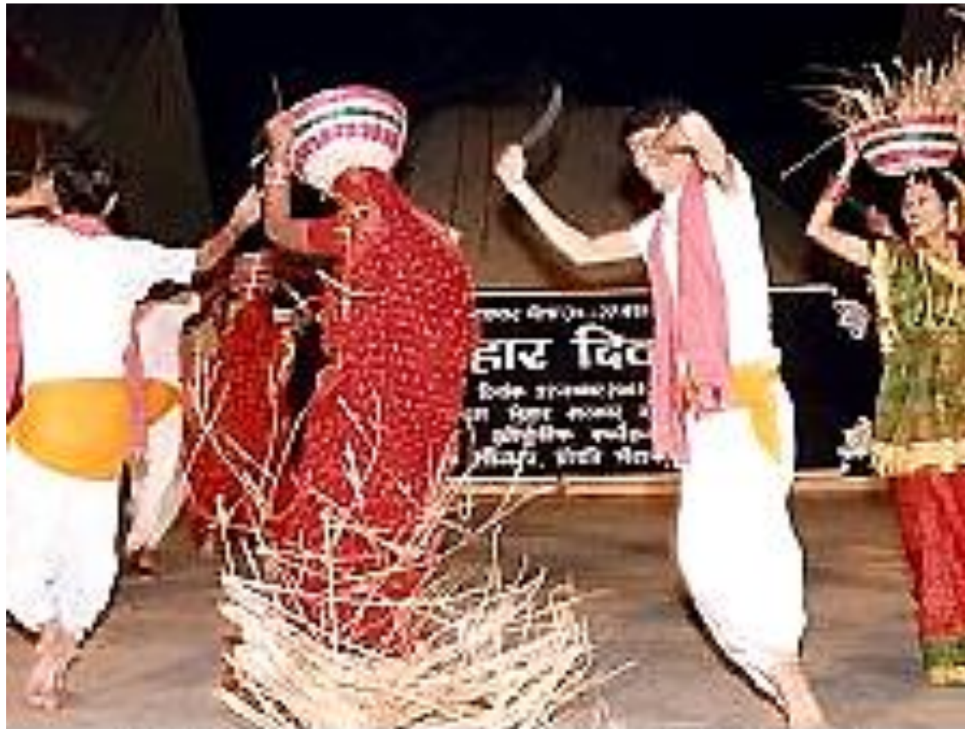
Movements of Jumari Dance